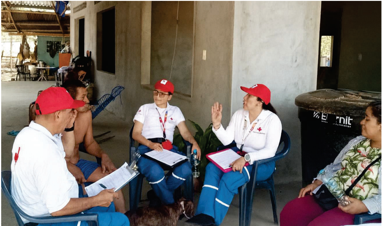
Surveys of households and markets to identify the most common effects when droughts occur in the municipality of Natagaima, Tolima.

The IFRC Disaster Emergency Fund Response Emergency Fund (DREF) has allocated CHF 216,996 for the implementation of anticipatory actions to reduce and mitigate the impact of droughts in Colombia. This Early Action Protocol includes an allocation of CHF 99,186 for year 1 readiness and prepositioning of stock, CHF 3,669 for year 2 readiness and prepositioning of stock as well as an allocation of CHF 114,139 for the implementation of early actions, if and when the trigger is reached. The early actions to be taken have been previously agreed with the National Society and are described in the summary of the Early Action Protocol https://go.ifrc.org/countries/48/ongoing-activities/emergencies