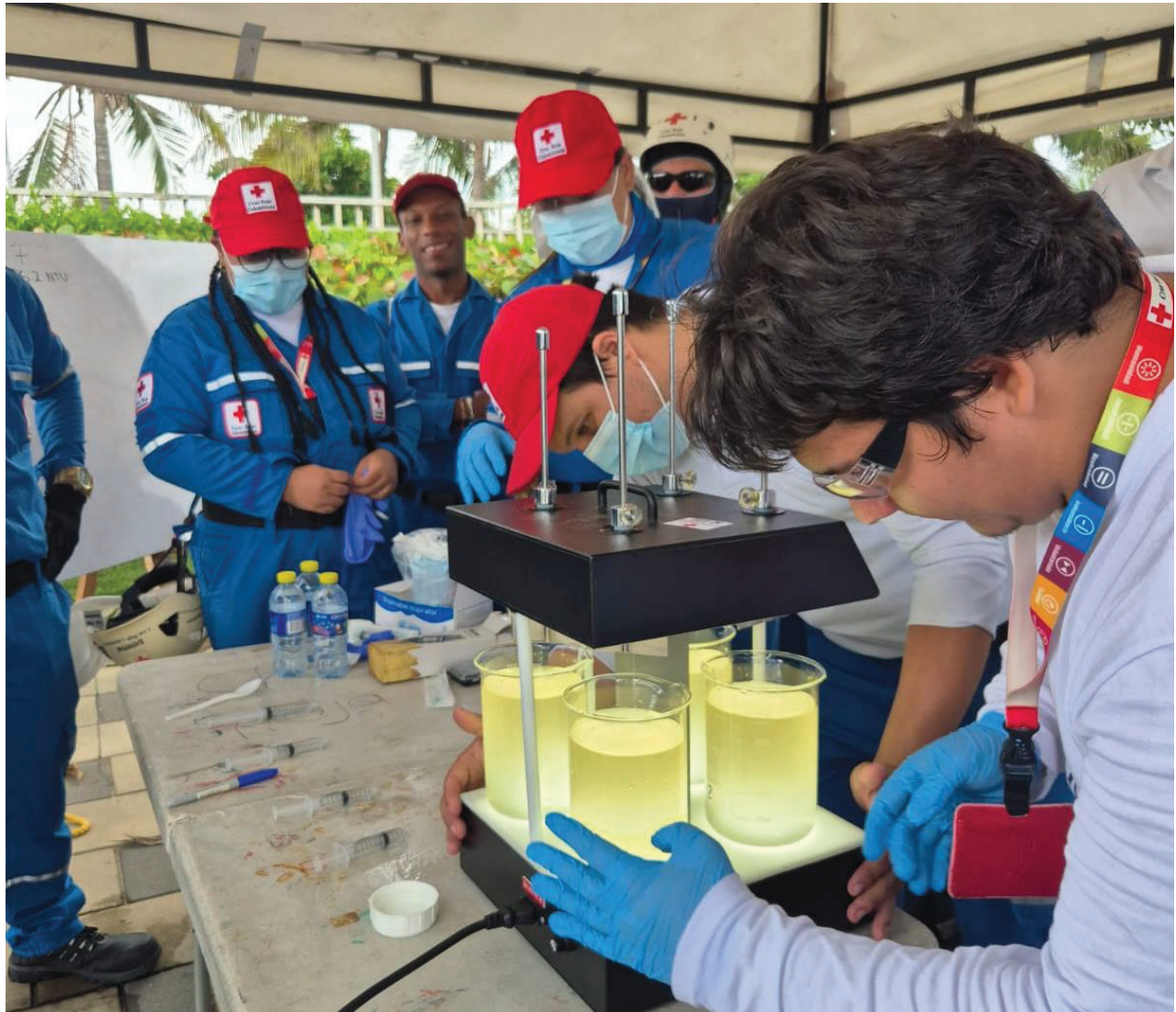
Water, Sanitation and Hygiene Workshop for volunteers from the Branches of the Caribbean Region. Colombian Red Cross, 9-10 October 2025. Barranquilla, Atlántico.